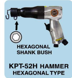
KPT-52H HAMMER HEXAGONAL TYPE