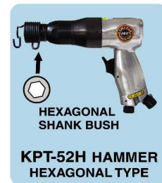
KPT-52H HAMMER HEXAGONAL TYPE