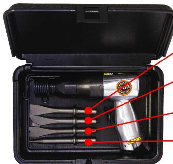
KPT-52K Weight.....2.6 kg