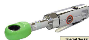
Special Sockets for KPT-20TR